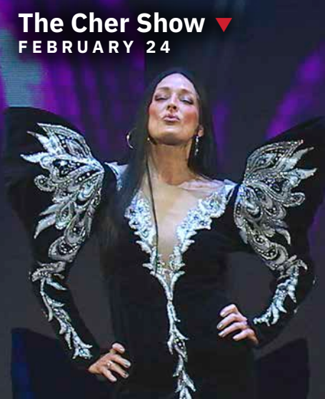
The Cher Show ▼ FEBRUARY 24