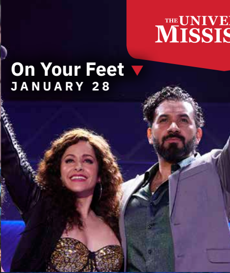
On Your Feet ▼ JANUARY 28