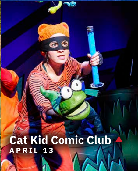
Cat Kid Comic Club ▲ APRIL 13