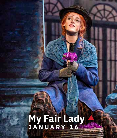
My Fair Lady ▲ JANUARY 16