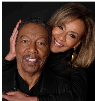
Marilyn McCoo & Billy Davis Jr.