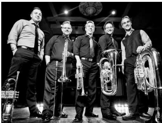
Presidio Brass... And All That Brass Tuesday, Apr. 5 Artist Series 7:30 p.m.