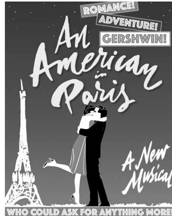
An American in Paris Tuesday, Apr. 26 NATIONAL TOUR Broadway Series 7:30 p.m.