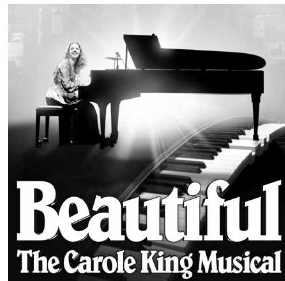
BEAUTIFUL – The Carole King Musical Thursday, May 19 NATIONAL TOUR Broadway Series 7:30 p.m.