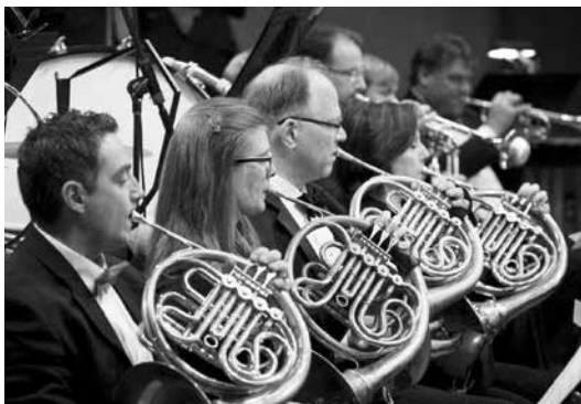
Beethoven's Ninth, Ode to Joy, Memphis Symphony Friday, Mar. 25 with University of Mississippi Choir and Memphis Symphony Chorus Artist Series 7:30 p.m.