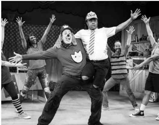
Dog Man: the Musical Saturday, Feb. 12 Family Friendly 10:30 a.m.